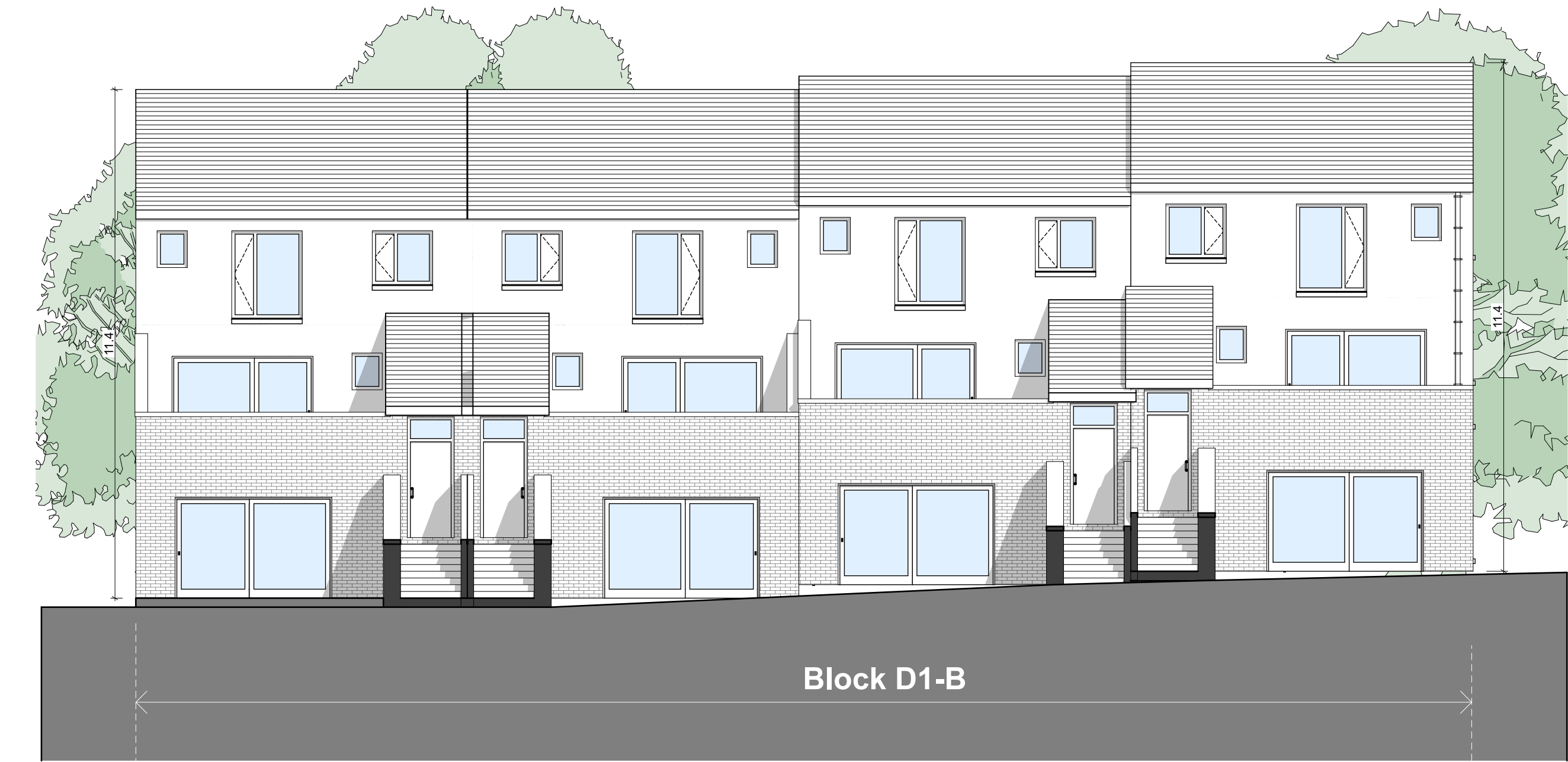
D1-B - West Elevation SCALE 1:100