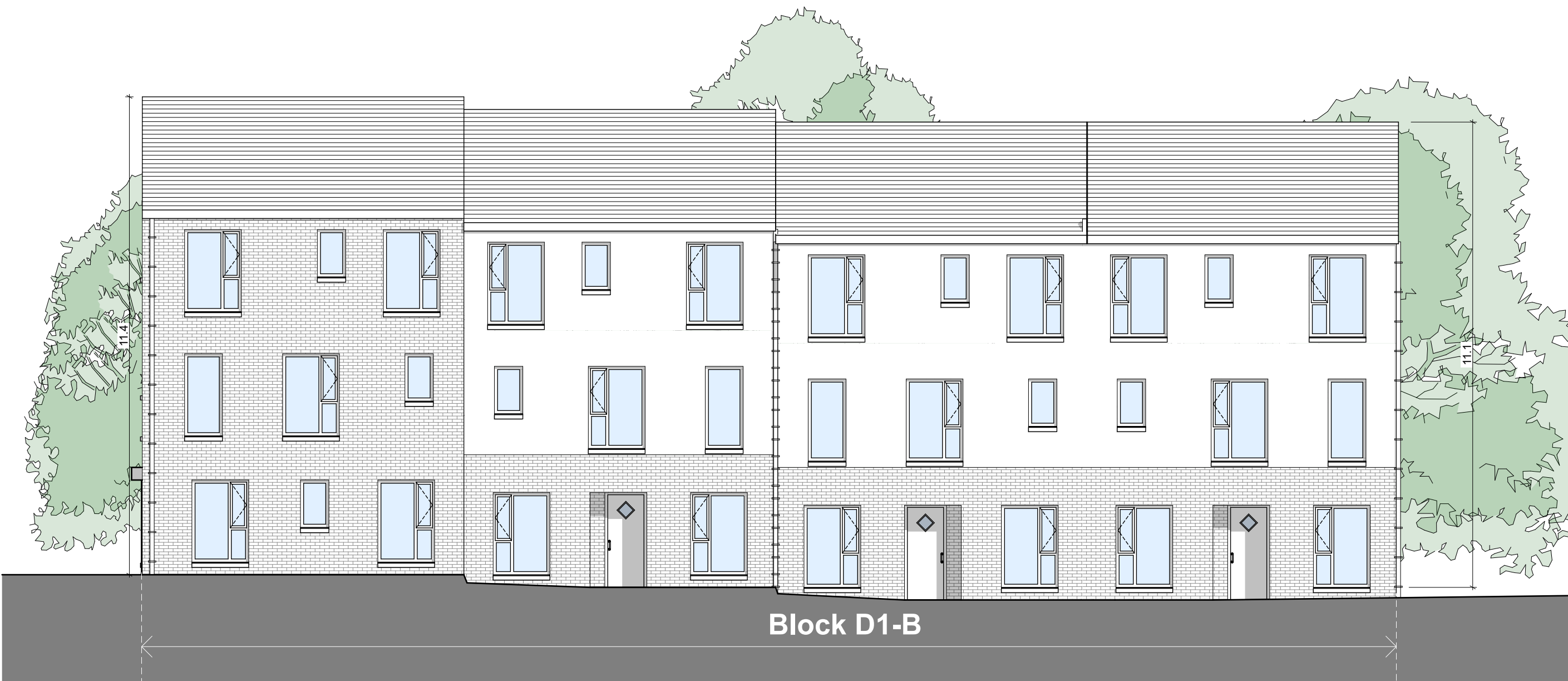
Block D1-B East Elevation SCALE 1:100